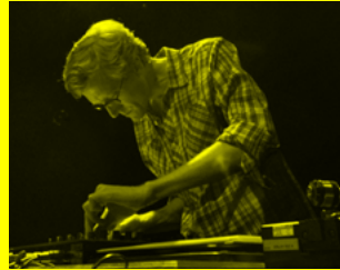
ANDY GRAYDON Artist USA // Based in Berlin www.andygraydon.net